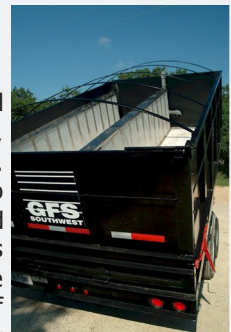
Wedgewater DCF™ portable model shown

The Dewatering Process with the Wedgewater DCF™ is as reliable and inexpensive as gravity – the Wedgewater DCF™ uses no moving parts in the dewatering process, there are no large motors, expensive bearings or highly-stressed components to fail and replace. And since it's made by GFS and engineered for YOUR application, you know you can trust it to do what you need it to do. The sturdy construction, corrosion-proof media, special corrosion- and scuff-resistant coating on the inside of the box, and use of stainless steel in critical areas assures that the Wedgewater™ DCF will provide many years of service with just minimal maintenance. The integral, state-of-the-art polymer feed system comes standard with the unit and is the essence of reliability and efficiency. No clumsy, outdated separate batching units or manual mixing of polymer and water is required.