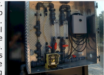
Integral Polymer Feed Unit

Wedgewater DCF™ is available as a stationary unit, or as a portable trailer unit. The stationary model can be mounted so that it dumps into any roll-off container, dump truck, or sludge staging area without the use of troublesome, costly conveying systems. And with the portable Wedgewater DCF™ trailer, you're not at the mercy of the disposal company's fees and schedules. You set your own schedule for removal of your cake solids, transporting them to an on- or off-site location — you decide when and where. The Wedgewater DCF™ can even do double-duty, dewatering and drying different types of solids, all from the same unit. It can also be taken to different sites for portable dewatering. Multiple units can be supplied for larger applications, with more being easily added later to expand with your needs.